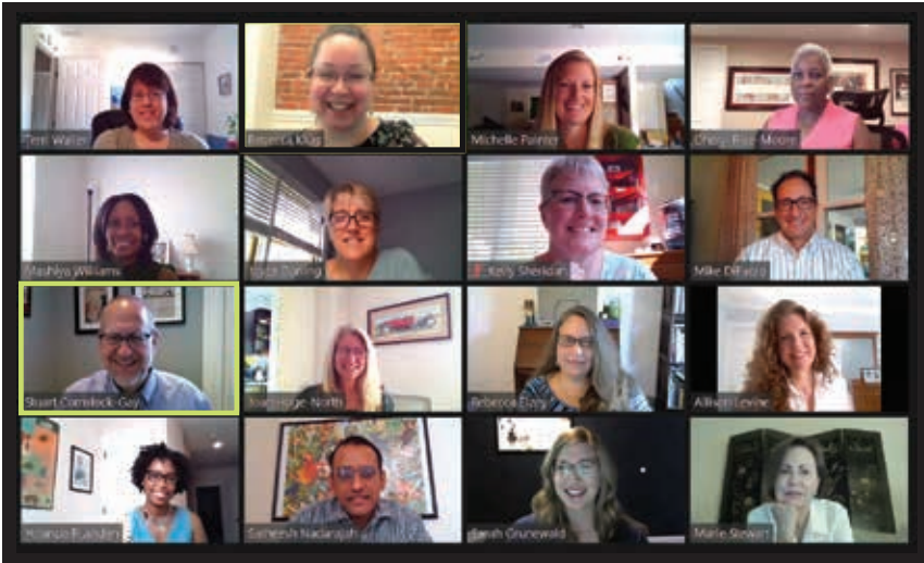
Our weekly remote staff meetings.