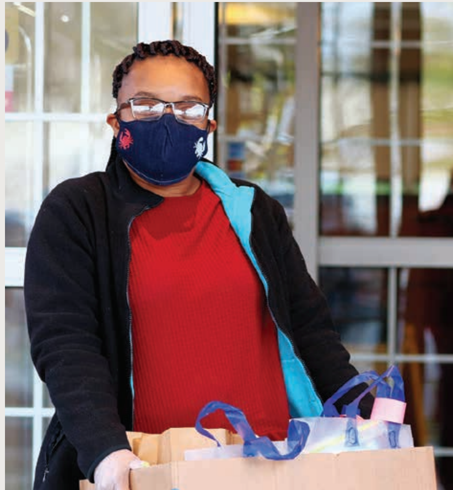
A volunteer with Love INC of Mid-Delmarva delivering food to those in need. Love INC received a $50,000 grant from the Delaware COVID-19 Strategic Response Fund to provide shelter for the homeless in Sussex County.

For more information, including a full list of grants awarded, visit delcf.org/covid-grantees .