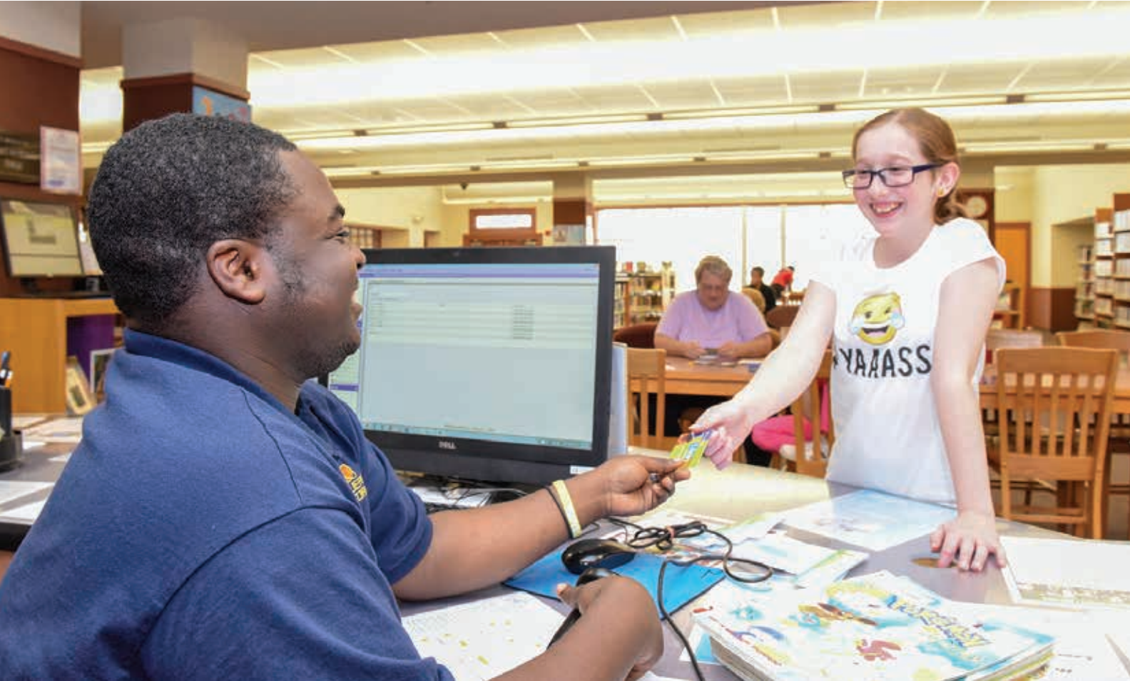
Laurel Public Library